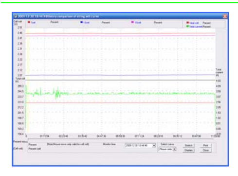
Discharging curves of each cells