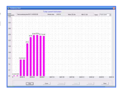
Histogram of difference cells