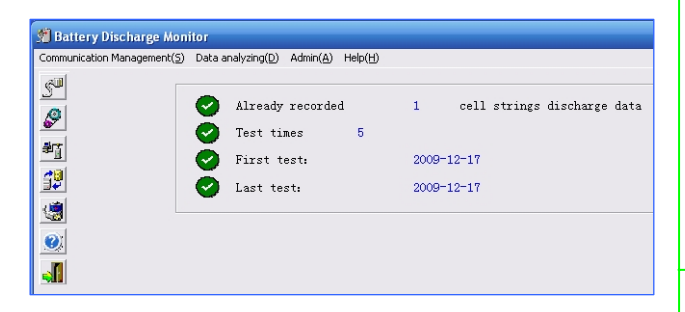
Simple interface with short-cut keys

All standard load units of PITE 3980 come with analyzing software. Real-time data monitoring (with DAC), testing data analyzing and report printing are all available with the PITE DataView software.