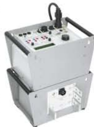
PCU1-SP and NLU5000

Where higher currents and powers are required for primary injection, 11kVA and 20kVA primary injection systems are available. The PCU1-SP and PCU2/E systems have separate control and loading units, allowing a wide range of load conditions to be covered with different loading units.