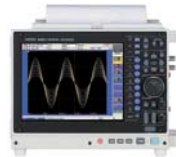
Hioki 8860 8 Channel High Speed Memory Recorder